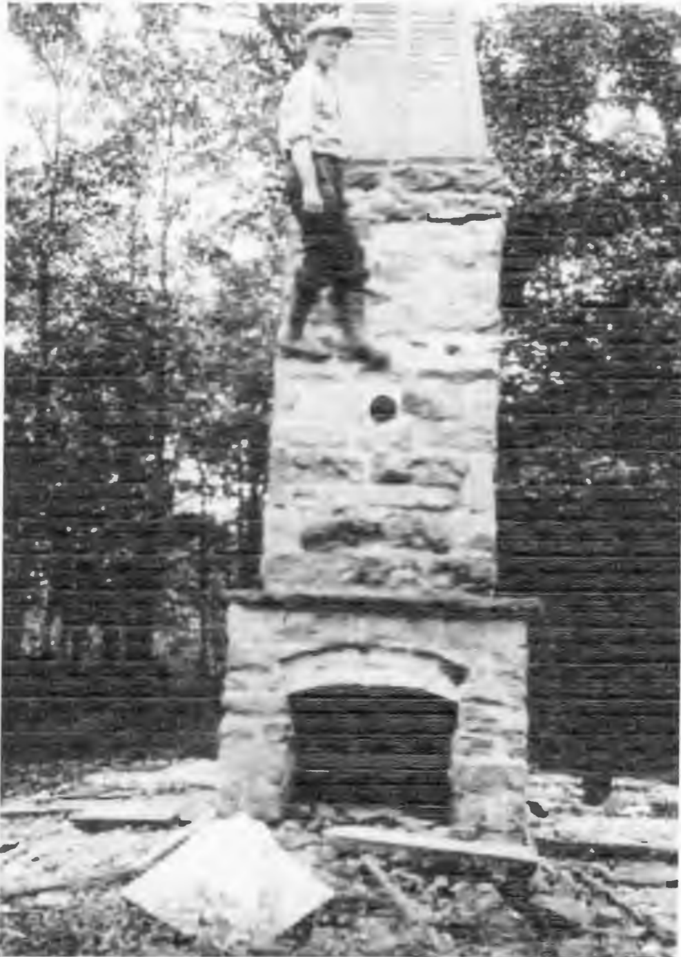
Picture taken probably in the 1930's Although the few remaining structures had quickly deteriorated, the Fireplace remained for many years.