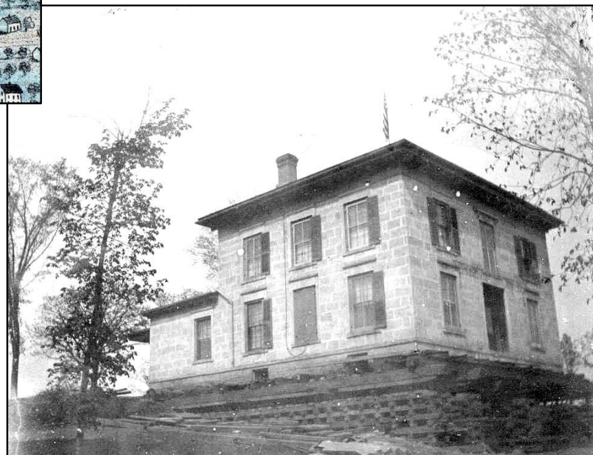
About the Yellow Ringling House, Illustration #1