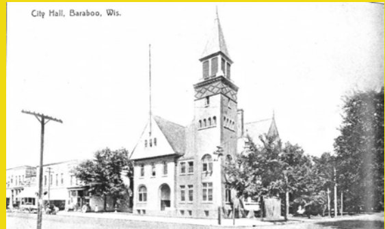
Baraboo's city hall, and site of its first public library circa 1897. Northwest corner of Fourth Street and Ash Street.

We cannot forget the library supporters who, from 2001 to the present day,