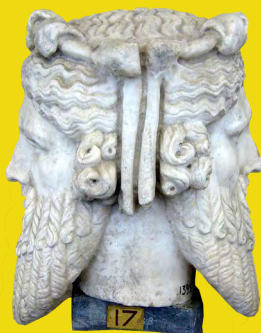
Head of Janus, Vatican museum, Rome

On September 18, 2020, the Baraboo Public Library will observe the 125th Anniversary—the quasquicentennial —of its formal existence. We are eager to embrace the changes and opportunities that lie ahead. But we will also take time this year to remember and celebrate the events and people contributing to a bright future.