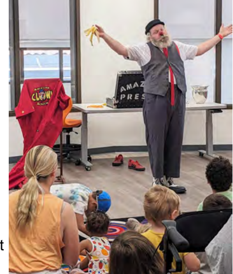
Tada! Presto takes a bow!

programming with our annual Clown Workshop. Presto the Clown taught kids all about the basics of clowning. Afterwards, kids did some crafts to make clown hats, collars, and ties, and got a chance to try out juggling, balance beam