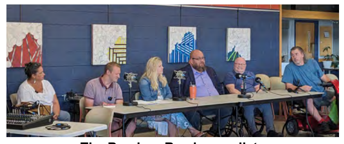
The Baraboo Reads panelists

of disability and ableism. At the Baraboo Reads event, attendees broke into groups to discuss the book, then came back together to hear from a panel of people who are experts on the topic of disability, either through personal or professional experience, or both. Attendees found the