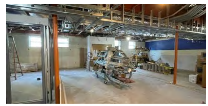
Lower level, future adult non-fiction collection