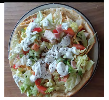
Judy's Tortilla Salad

Judy does not usually like hot and spicy recipes and kept looking for dishes without many spices. She made a delicious salad with "lots of veggies and warm flour tortillas. She also made her own sour cream, dill, milk, and mayo dressing, and used tomatoes, cheese, green, red, and yellow peppers, cauliflower, broccoli, and ham. She combined a couple of different recipes. She enjoyed this dish but thinks she would use a salsa dressing next time instead of a creamy dressing, and she would definitely warm the tortillas again.