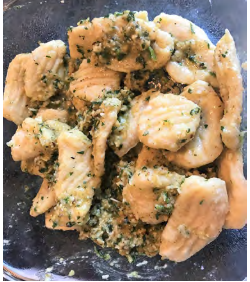
Iveta's Gnocchi with Parsley Pesto

dumpling from Frame by Frame Italian . The recipe called for mashed potato, egg, flour, and parmesan cheese. She made a log out of the mixture, and cut slices from it which she then shaped. Iveta served the gnocchi with a pesto sauce made from walnuts, garlic, and parmesan cheese.